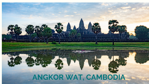
ANGKOR WAT, CAMBODIA

There are more than 1,000 locations on the prestigious list of UNESCO World Heritage sites, a roster of places considered to be of outstanding value to humanity, whether for cultural or natural reasons. The list includes everything from European towns to tropical islands, American national parks to African churches, and endangered wonders at risk of disappearing. Here are our picks for the 10 most stunning UNESCO World Heritage sites - why not visit one (or more) next year??