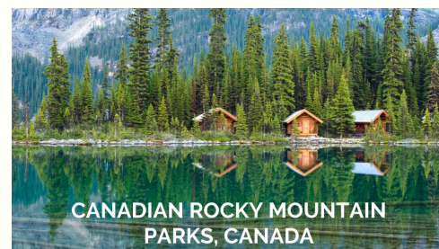
CANADIAN ROCKY MOUNTAIN PARKS, CANADA