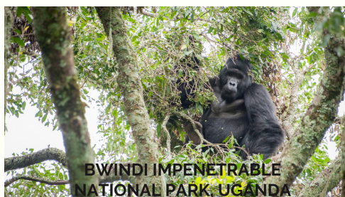
BWINDI IMPENETRABLE NATIONAL PARK, UGANDA