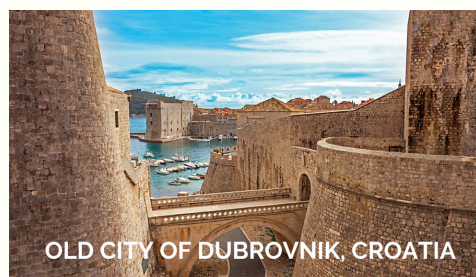
OLD CITY OF DUBROVNIK, CROATIA