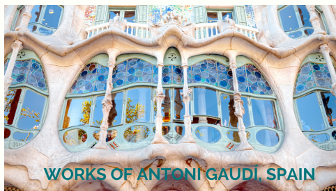
WORKS OF ANTONI GAUDI, SPAIN