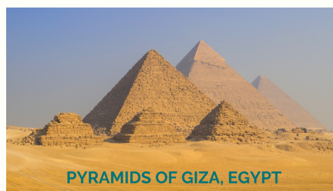
PYRAMIDS OF GIZA, EGYPT

If these inspire you, remember we can tailor any holiday specifically for you, whether it's solo travel, group tours or family adventures you are looking for!