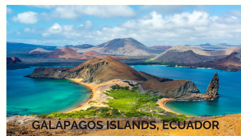
GALAPAGOS ISLANDS, ECUADOR