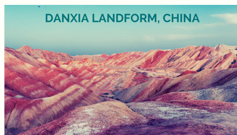
DANXIA LANDFORM, CHINA